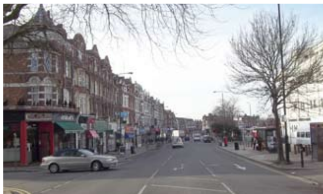
Views along North End Road, looking eastwards towards the crossroads