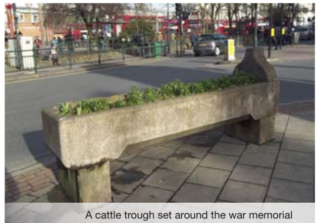
A cattle trough set around the war memorial