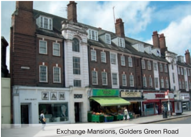
Exchange Mansions, Golders Green Road