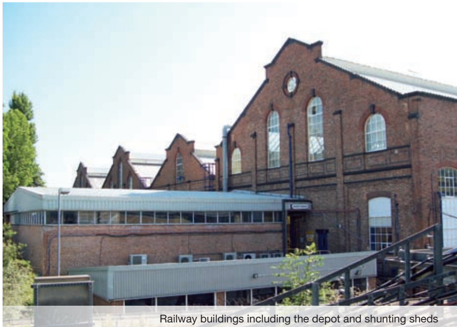
Railway buildings including the depot and shunting sheds