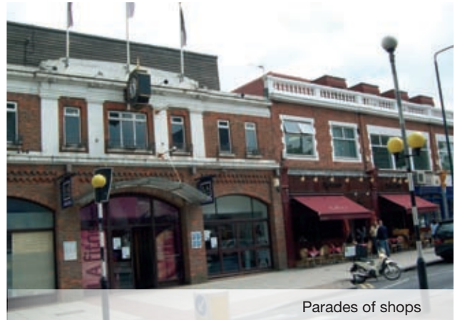
Parades of shops