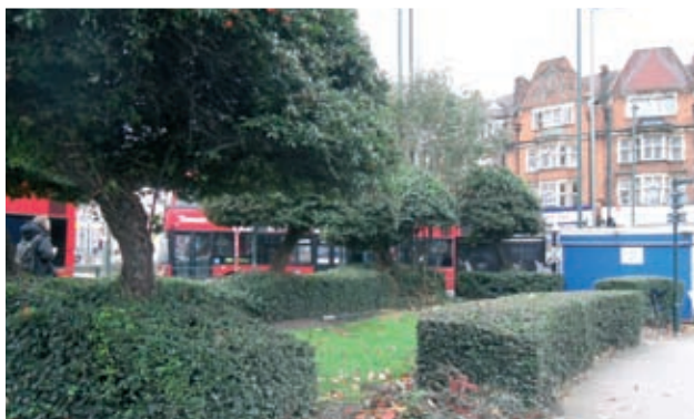
Green space beside bus station, includes trees and hedges