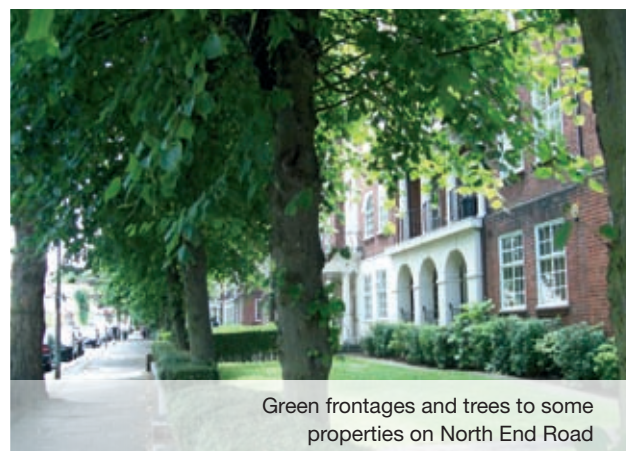
Green frontages and trees to some properties on North End Road

Several of the trees in the Conservation Area are included in Tree Preservation Orders (e.g. along North End Road and West Heath Avenue) and formal council consent is required for their treatment. The other trees in the Conservation Area are protected more generally. In accordance with the legislation,