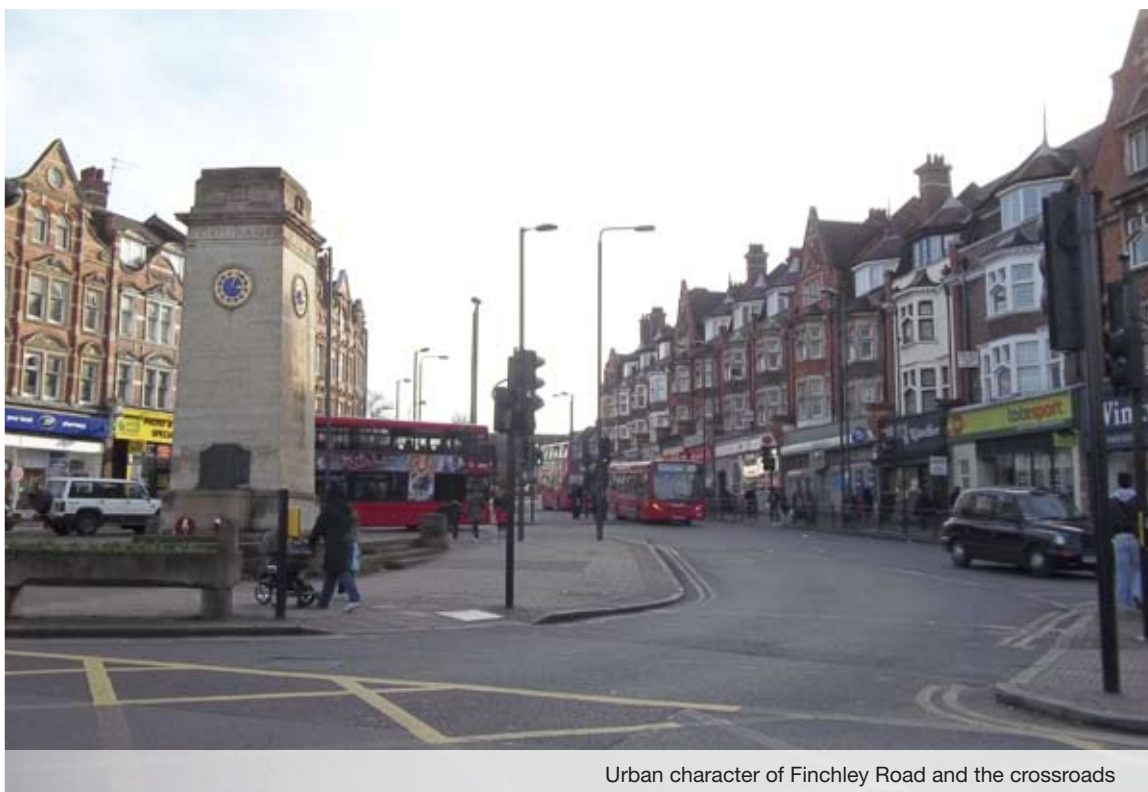
Urban character of Finchley Road and the crossroads

with continuous pavements on either side. Heavy traffic and parking are particularly notable on North End Road. It is a well used thoroughfare for both pedestrians and vehicles. Finchley Road is urban in character, noisy and vibrant, particularly around the station while Golders Green Road is more formal and ordered in layout.