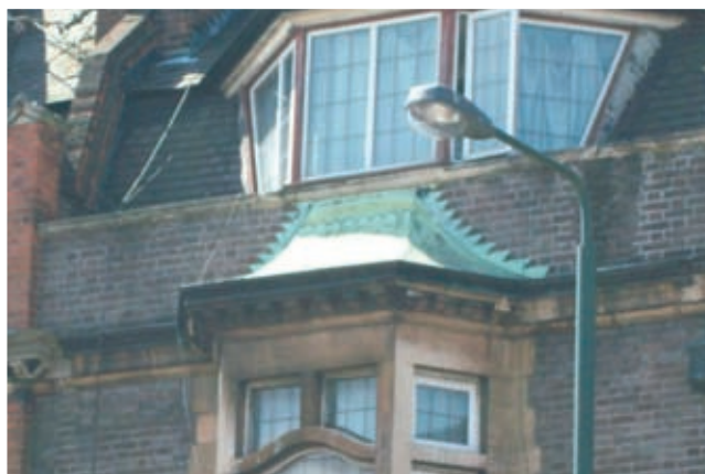
Copper canopy over bay window on the Crescent Parade

Lead and copper are occasionally used for flat or curved dormers, canopies over bay windows and small porches, finials and domes. e.g. The Parades, Golders Green Road.