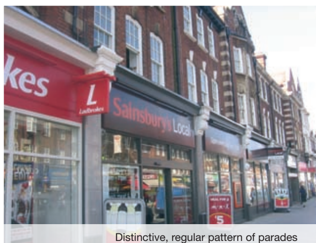
Distinctive, regular pattern of parades