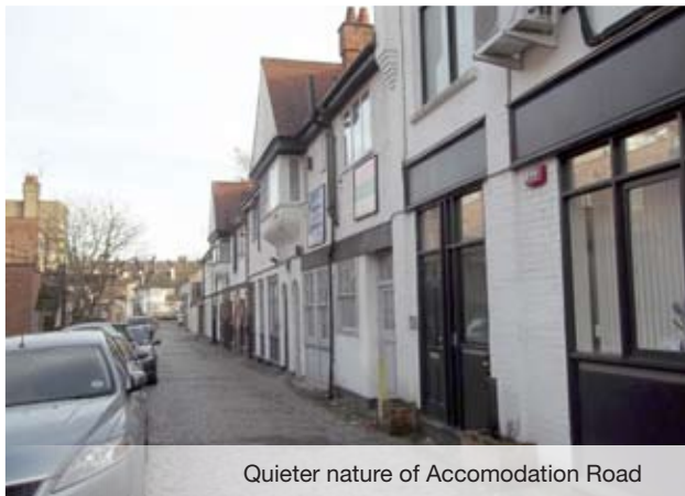
Quieter nature of Accommodation Road

uses. The rear of the shop parades have a varied and distinctive character as shown in the photographs below. Because of the nature of their use, acting as a service area to the shops and providing a frontage to the businesses opposite, they can be cluttered, and there are occasional problems with flytipping. The railway arches off Finchley Road provide accommodation for industries such as garage workshops.