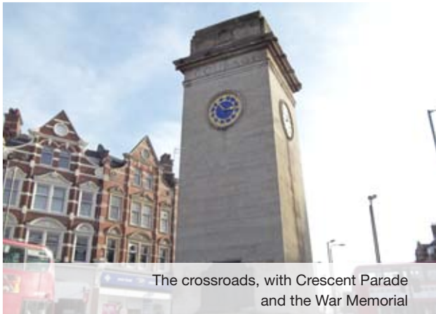
The crossroads, with Crescent Parade and the War Memorial