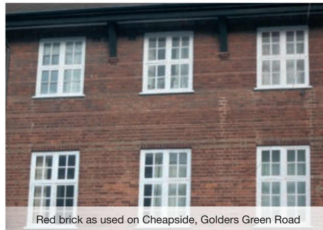
Red brick as used on Cheapside, Golders Green Road

Historically, handmade bricks and tiles were made locally. After brick making methods improved in the 18th century, brick became cheaper and more fashionable resulting in a variety of colours being produced in addition to the red brick. In Golders Green red/brown brick is used along with various shades of orange and brown in the later Victorian era. Decorative brickwork is a feature of these buildings, and some have contrasting colours. Others use soft clay rubbed bricks and gauged arches above the window or door openings.