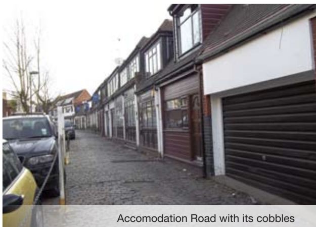
Accomodation Road with its cobbles