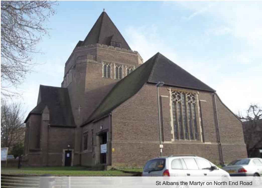
St Albans the Martyr on North End Road