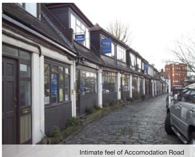
Intimate feel of Accomodation Road

North End Road, with its relatively steep incline and mixed character, tends to have a less formal feel particularly at its eastern end. Pavements are narrower and spaces more intimate with large and mature street trees at the edge of the pavement. These shield the pedestrians from the passing traffic, provide seasonal interest and frame views down to the crossroads. As the road levels out, the