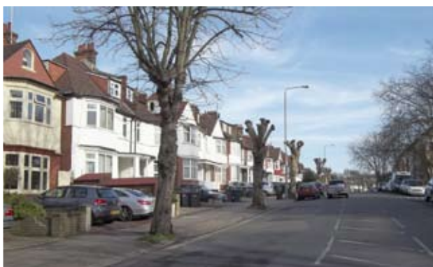
Views along North End Road showing housing and tree line beyond edge of conservation area