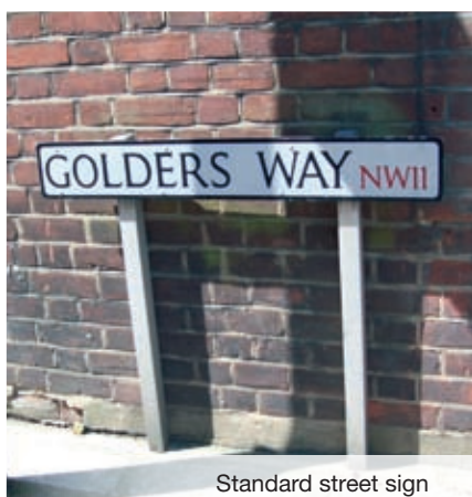
Standard street sign