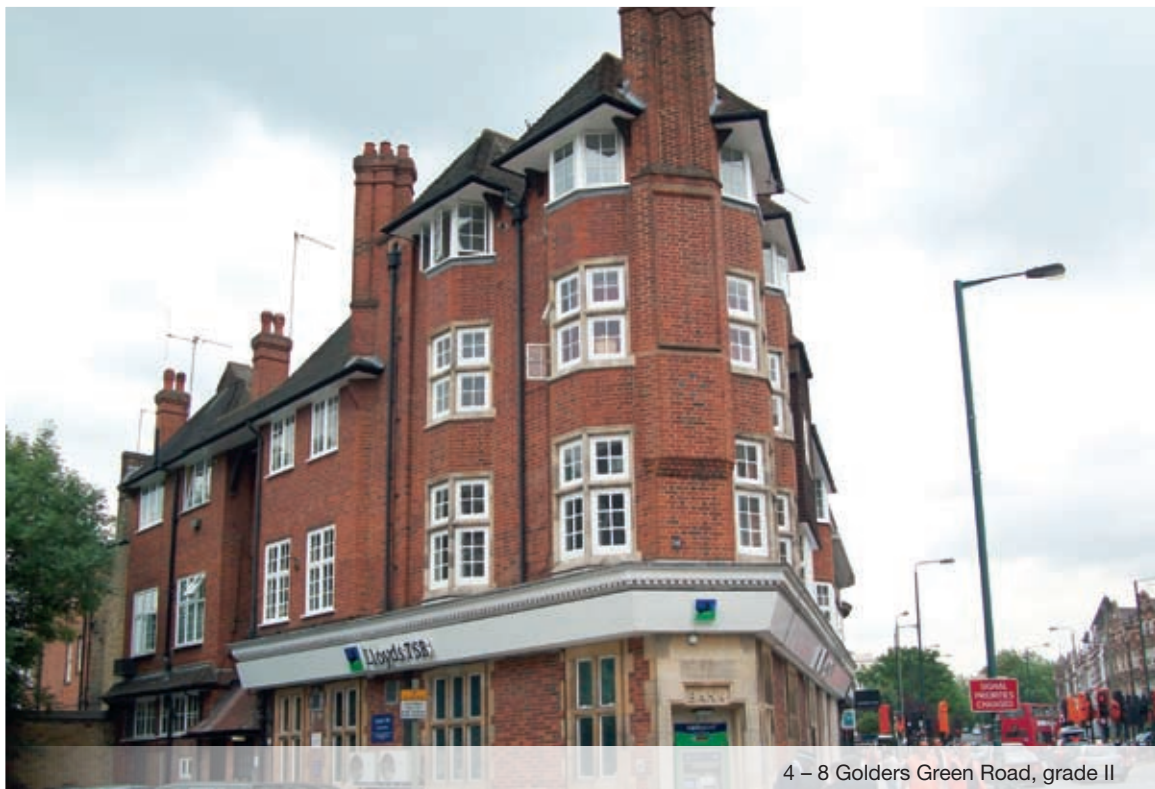
4 – 8 Golders Green Road, grade II