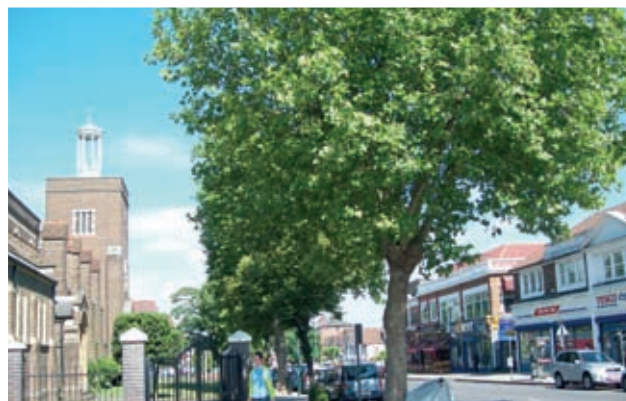
Leafy frontage to St Michael's Church