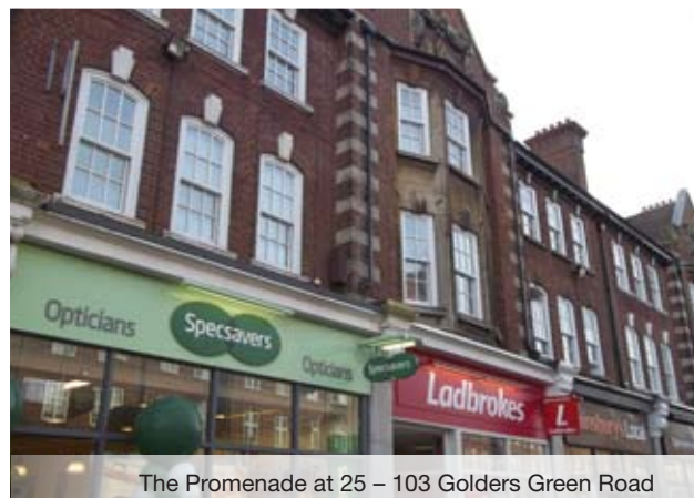
The Promenade at 25 – 103 Golders Green Road