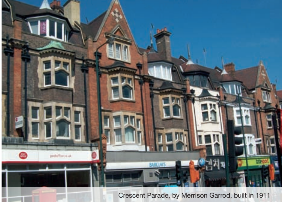
Crescent Parade, by Merrison Garrod, built in 1911