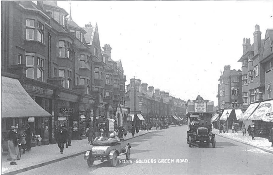
Golders Green Road, 1920s. Change is in the air! A woman driver steers the latest sports car. The 84 bus route at that time went to St Albans via Ballards Lane, Whetstone and Chipping Barnet.

which had previously run from Temple Fortune to Finchley, was then obliterated. As can be seen on the maps of the time, it similarly paid little respect to the earlier field layouts cutting through with Roman-like straightness.