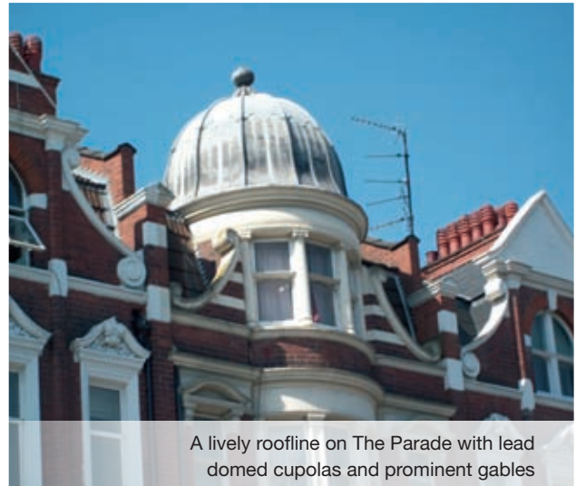
A lively roofline on The Parade with lead domed cupolas and prominent gables