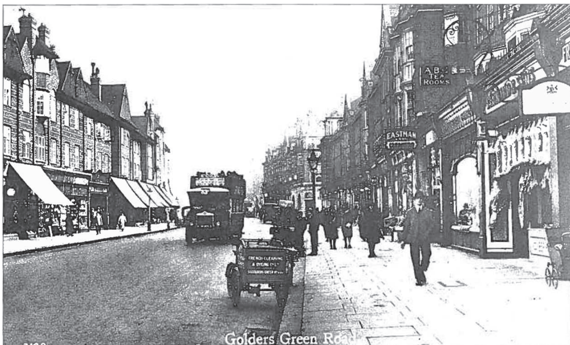
Golders Green Road, 1920s. The box tricycle in the foreground was a popular method for delivering goods of every description. It was also famously used by Walls' Ice-cream whose slogan was 'Stop Me and Buy One'. The butcher's shop on the right, with its open frontage displaying carcasses of meat, was a typical feature of those days. Fishmongers used similar shops.