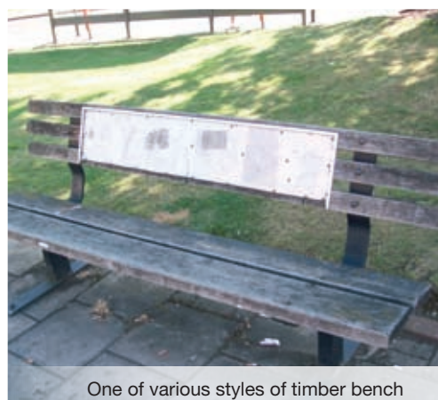
One of various styles of timber bench