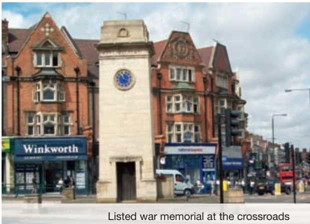
Listed war memorial at the crossroads