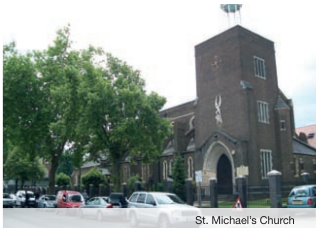
St. Michael's Church