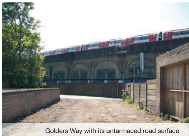
Golders Way with its untarmaced road surface