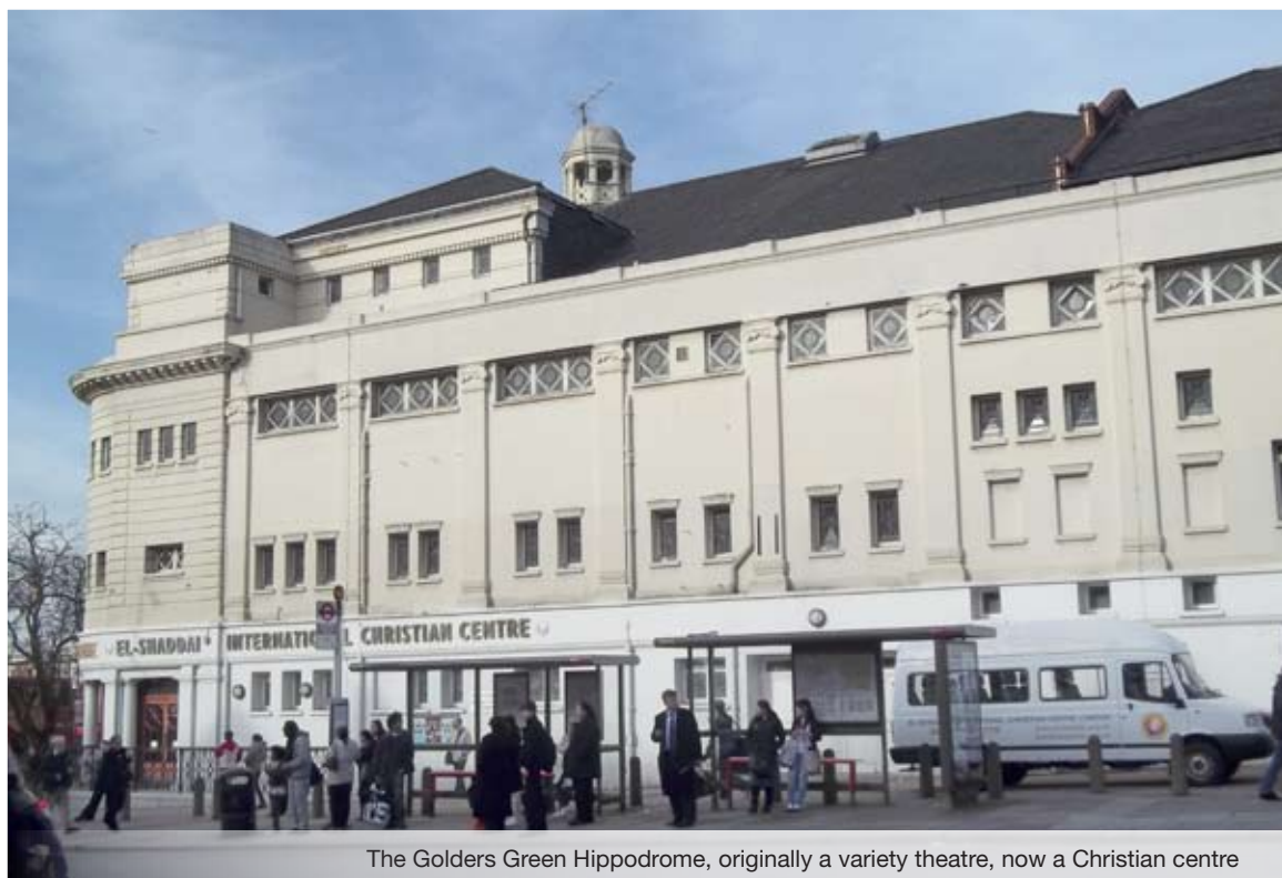
The Golders Green Hippodrome, originally a variety theatre, now a Christian centre

The Conservation Area includes a number of places of worship including the Golders Green Hippodrome, which is adjacent to the underground station, St. Michael's Church (which became the Greek Orthodox Cathedral of the Holy Cross and St. Michael in 1970) at the extreme western end of Golders Green Road, St. Alban's the Martyr on North End Road along with a number of mainly small synagogues which tend to re-use other buildings, such as at 5 – 11 Broadwalk Lane.