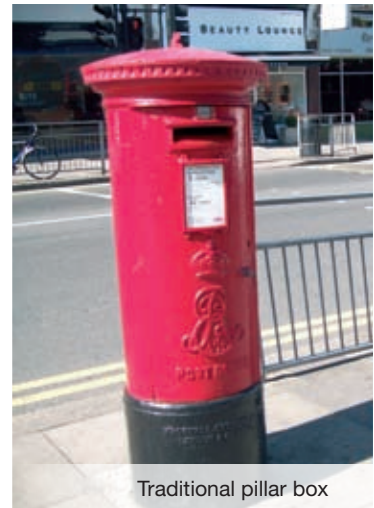
Traditional pillar box