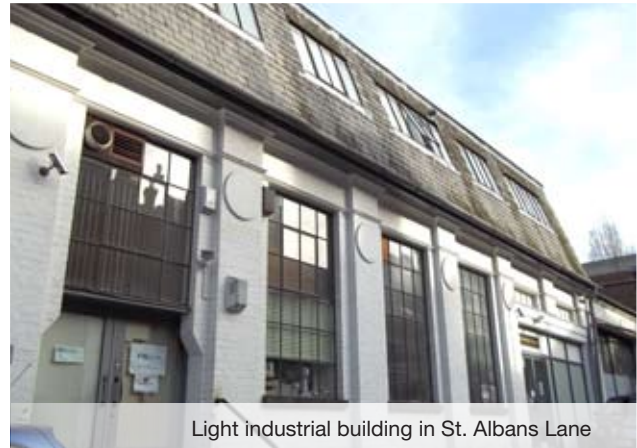
Light industrial building in St. Albans Lane