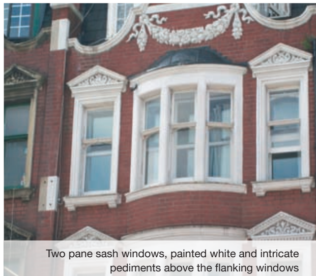
Two pane sash windows, painted white and intricate pediments above the flanking windows

The predominant window types in the Conservation Area are traditionally detailed timber vertically sliding sashes and casements. Casements and sashes can be seen with a mixture of glazing divisions, from a simple two panes through to six or eight panes. In respect of the sashes, there is often a purposeful mixture of pane sizes within one building, together with a mixture within a single window e.g. the upper sash with multiple divisions, the lower sash with just two. Window openings are commonly recessed. Most windows are painted white although a significant number are darker e.g. Finchley Road 867 – 893. Some casements have decorative leaded lights.