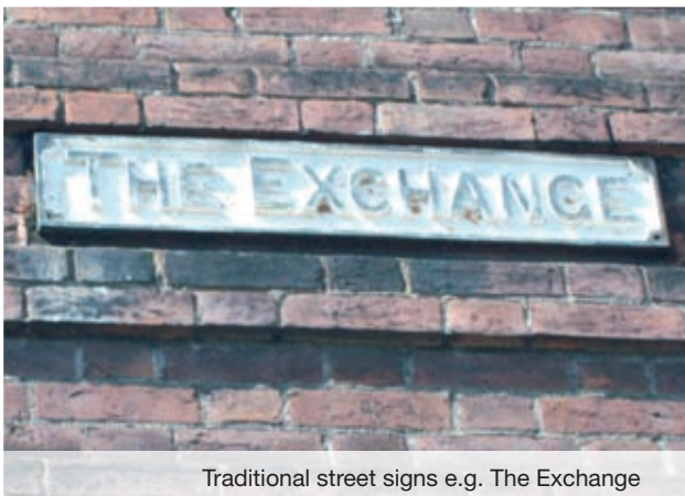
Traditional street signs e.g. The Exchange