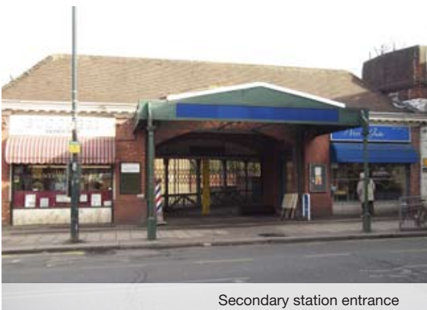
Secondary station entrance