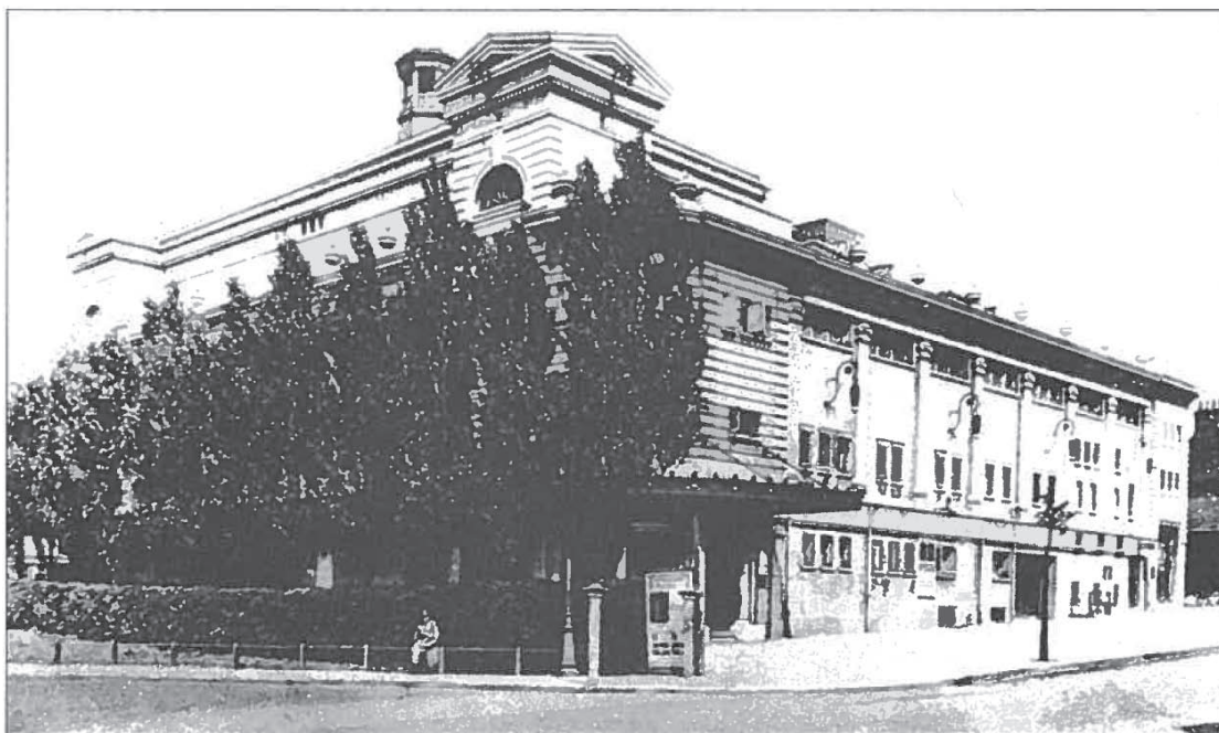
The Hippodrome Theatre in Golders Green opened on 26 December 1913. In its earlier years it was mainly a music hall but from 1922 until it closed in 1968 it also staged touring theatrical productions, orchestral concerts, ballet and opera. There was hardly an artiste of any note who had not, at one time or another, trodden its boards.

Golders Green at the end of the 18th Century, and prior to the new road, was a widened area of common land on either side of the road to Hendon. This area, known as the 'waste', was approximately 400 – 500 yards wide and one mile long. The two larger landholders were the Dean & Chapter of Westminster and the Eton College Trustees. Minor enclosure of the 'waste' had been happening since 1700 but with the creation of the new road, the land near Temple Fortune was added to adjoining fields between 1826 and 1860. By 1880 most of the open land had been enclosed but the area was still defined by modest country villas and farms surrounded by fields. The new road had surprisingly little development impact at Golders Green but did make a major difference at Tally Ho, further north. The only major development up to the end of the 19th Century was the Jewish Cemetery (1897) and the Golders Green Crematorium, the first of its kind in London, which opened in 1902.