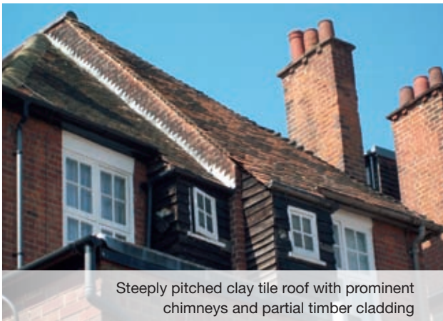
Steeply pitched clay tile roof with prominent chimneys and partial timber cladding