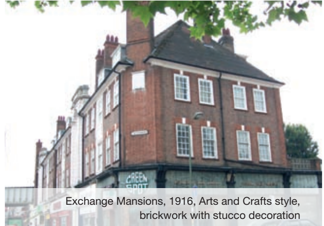
Exchange Mansions, 1916, Arts and Crafts style, brickwork with stucco decoration