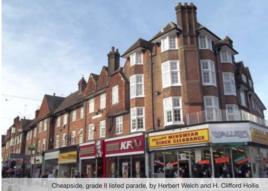
Cheapside, grade II listed parade, by Herbert Welch and H. Clifford Hollis

Three storeys in early Art Nouveau style. 19 – 21 Golders Green Road terminates the parade with Portland stone on the ground floor, in use today as a bank; The Promenade with gentle curve, (25 – 89 Golders Green Road) listed grade II by Herbert Welch built in 1909 in the Baroque style