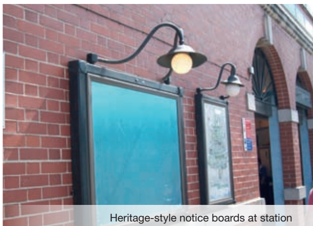
Heritage-style notice boards at station