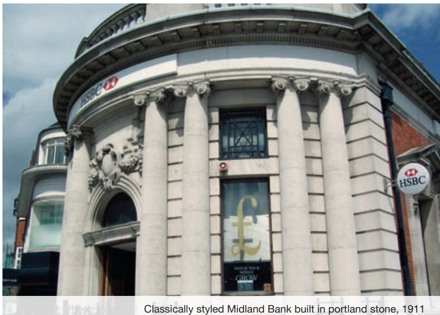
Classically styled Midland Bank built in portland stone, 1911