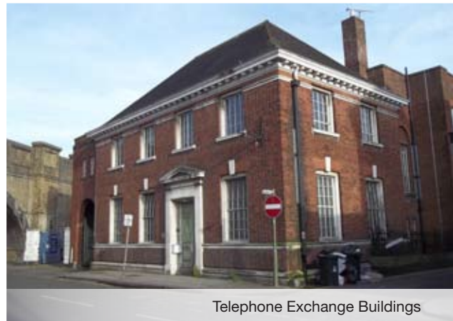
Telephone Exchange Buildings