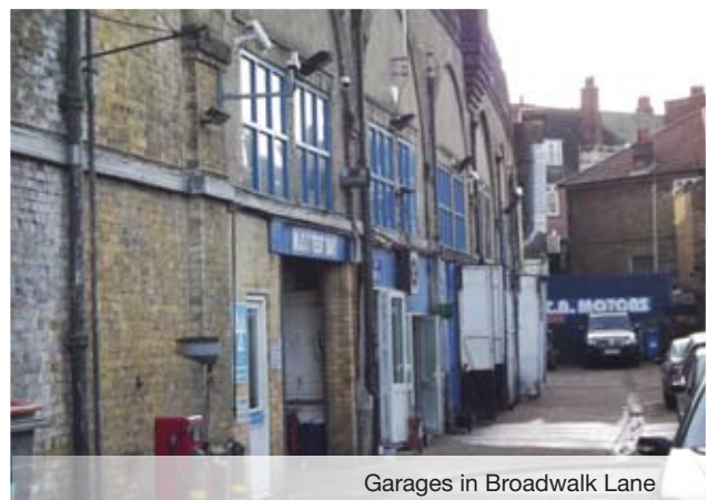
Garages in Broadwalk Lane