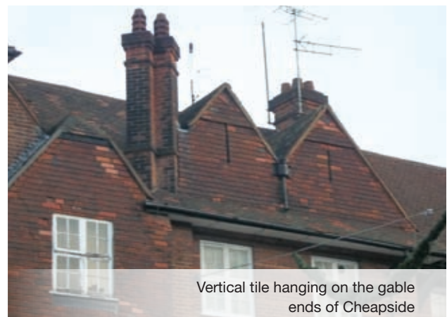
Vertical tile hanging on the gable ends of Cheapside

Locally manufactured clay tiles, feature on the upper floors of some buildings particularly gable ends e.g. Cheapside.