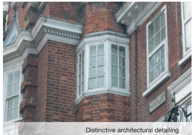
Distinctive architectural detailing