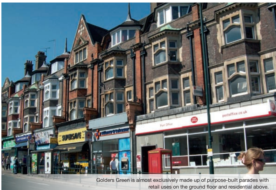
Golders Green is almost exclusively made up of purpose-built parades with retail uses on the ground floor and residential above.

The parades have traditionally included many cafes and notable restaurants, and still do so today. Many cater specifically for the Jewish community such as Solly's restaurant on Golders Green Road. Staple goods such as food and household items are catered for by supermarkets such as Sainsbury's, which has stores on both Finchley Road and Golders Green Road.