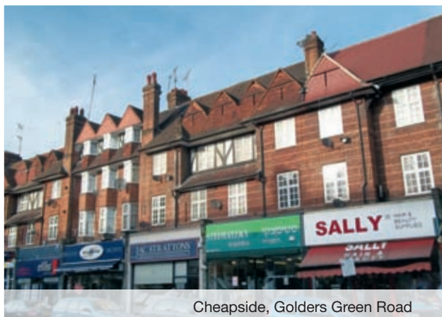
Cheapside, Golders Green Road