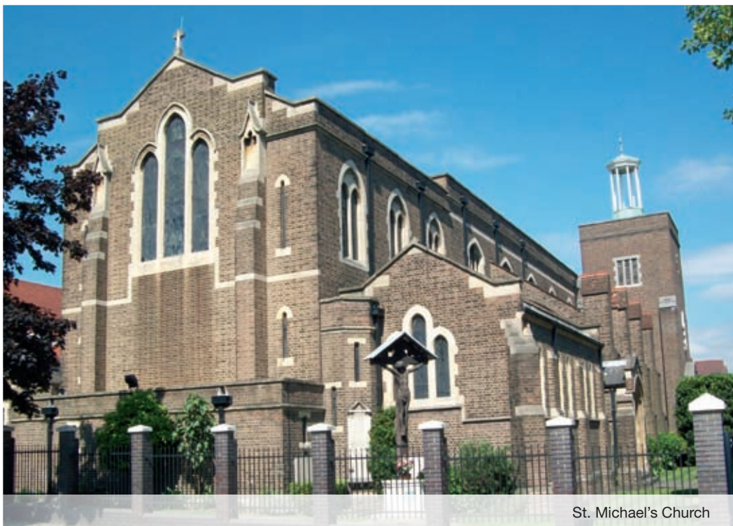
St. Michael's Church

The railway interchange and bus / coach station dominates the junction of Finchley Road with Golders Green Road and North End Road. The area is very busy and noisy with buses, coaches and associated passenger traffic, particularly at peak times, when conflict can arise between traffic and pedestrian needs.