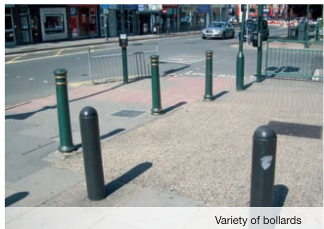
Variety of bollards