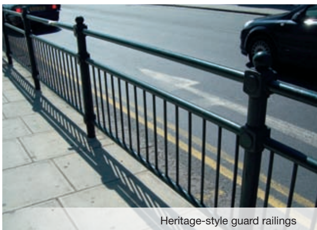
Heritage-style guard railings