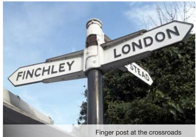
Finger post at the crossroads