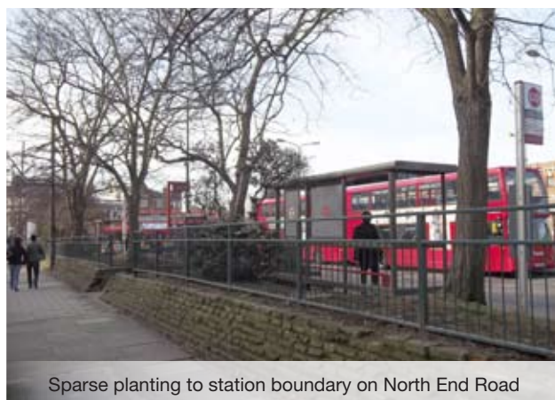
Sparse planting to station boundary on North End Road