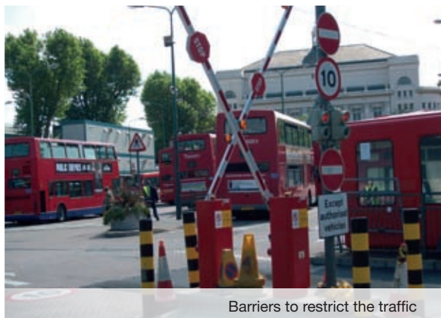
Barriers to restrict the traffic