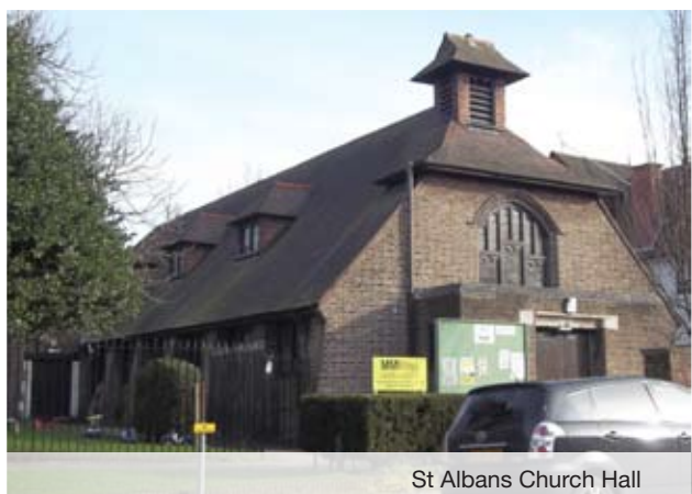
St Albans Church Hall