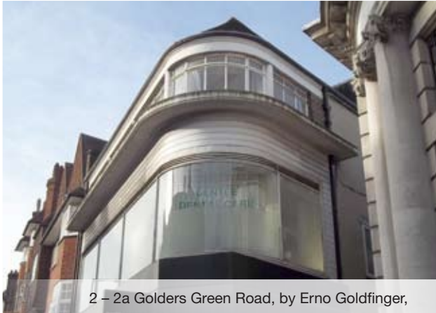
2 – 2a Golders Green Road, by Erno Goldfinger,