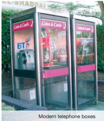
Modern telephone boxes