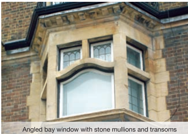
Angled bay window with stone mullions and transoms