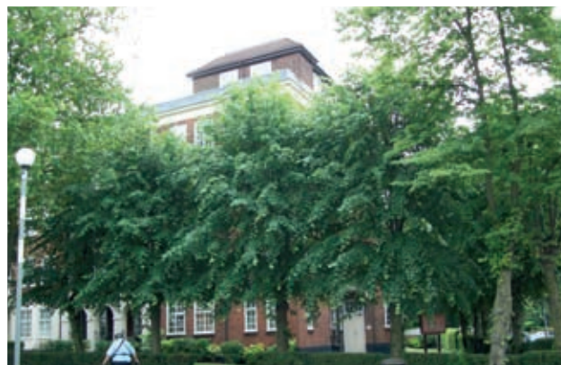
5 storey West Heath Court frontage