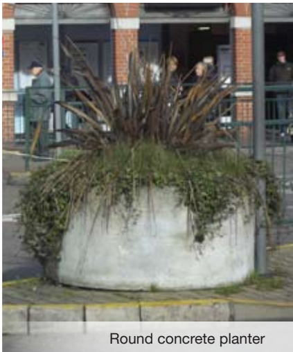
Round concrete planter