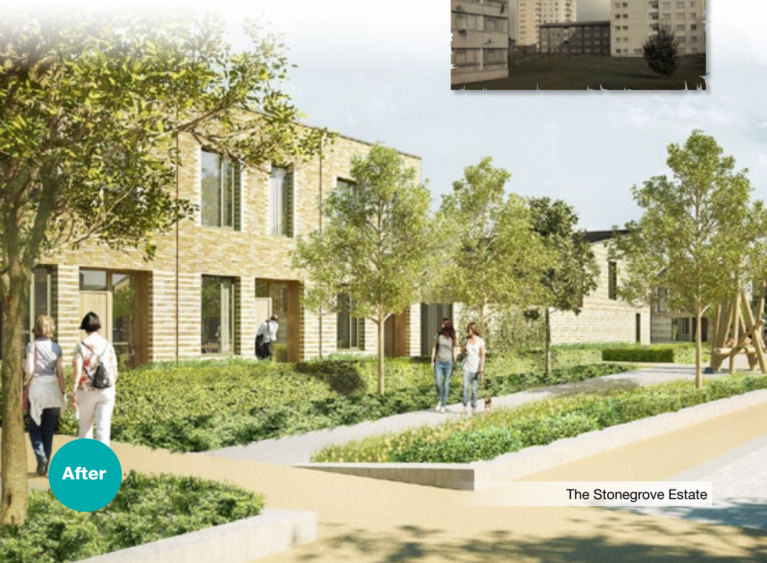
The Stonegrove Estate