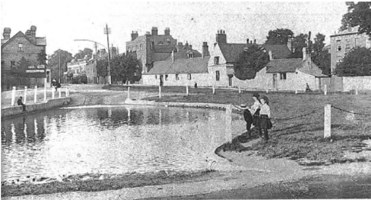
62. The Burroughs Pond may not have been as grand as the Burroughs Lodge lake, but its scenic qualities were appreciated by artists and commercial photographers alike. It was effectively destroyed by the coming of the Watford Way in the 1920s. The low white buildings on the right had been the parish cottages annexed to the old parish workhouse, which stood behind them. All were demolished in 1934 and replaced by Quadrant Close.

The Burroughs has a number of interesting historic buildings. Some 18th and 19th Century houses, statutorily listed, survive close to the junction of the Burroughs and Watford Way. Nos. 9-11 are early 18th Century, faced in brown brick with red dressings. Ivey House, No. 13 is late 18th Century, brown brick facing with full height segmental bow and panelled parapet. No. 15 is a 18th Century brown brick house with a parapet and double pitch slate roof.