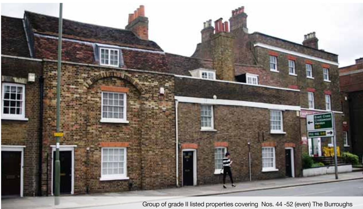
Group of grade II listed properties covering Nos. 44 -52 (even) The Burroughs

Attached to the college building, and sitting directly on the footway, is a group of grade II listed cottages (Nos. 44 – 52 even) which also date from the 18th Century. The yellow brick cottages are two storeys