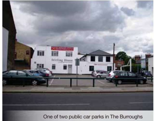
One of two public car parks in The Burroughs

Sitting proud of this group of listed properties is No. 17a, a single storey, flat-roofed, brick built building with large six-pane opaque shopfront facing the street. The building is now occupied by an independent record store.