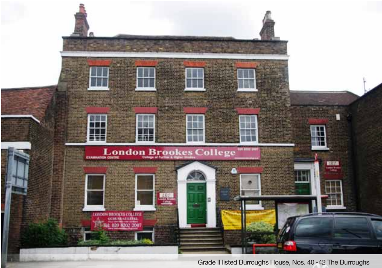
Grade II listed Burroughs House, Nos. 40 -42 The Burroughs

accommodation, four windows wide constructed from yellow brick which has weathered significantly. It displays a good Roman Doric pedimented staircase to the front. A hipped tiled roof is located behind a parapet.