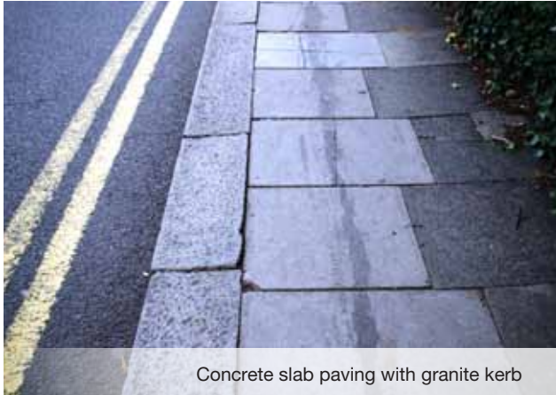
Concrete slab paving with granite kerb

Street paving within the Conservation Area consists of standard concrete pavers, many of which are in a poor state of repair. Occasionally, tarmac is used, with kerbing made out of granite.