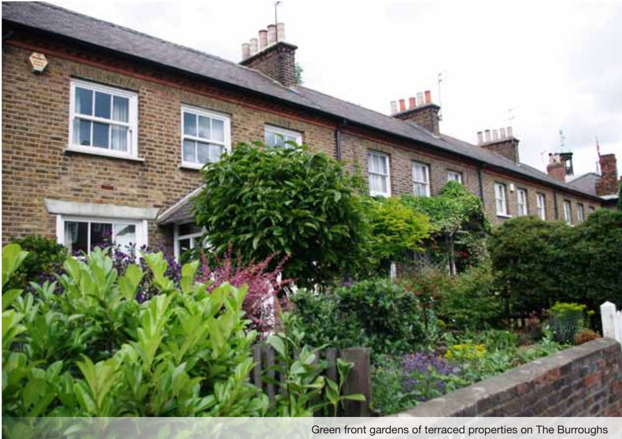
Green front gardens of terraced properties on The Burroughs

The front gardens of some of the residential terraced properties provide a degree of softening of the hard landscape found elsewhere within the Conservation Area. Other than this, there is no provision of public green spaces within the Conservation Area.