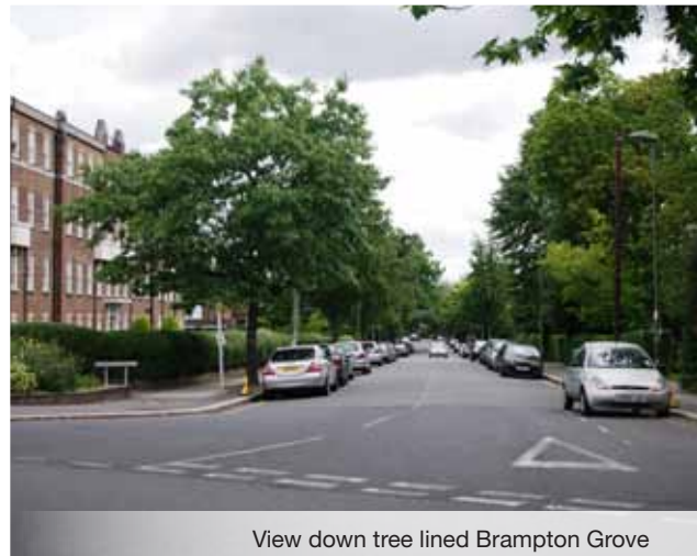
View down tree lined Brampton Grove