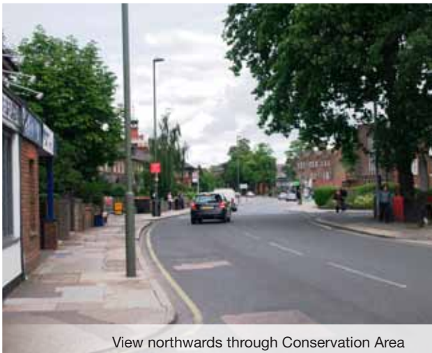
View northwards through Conservation Area

There are two key views in the Conservation Area. The first is that from the junction of Watford Way looking north along The Burroughs, where the majority of the historic buildings exist. The second is looking eastwards along the length of the tree-lined Brampton Grove.