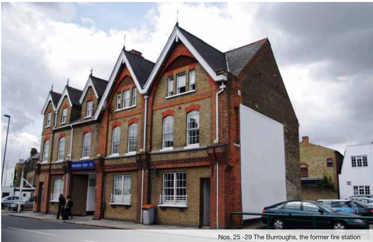
Nos. 25 -29 The Burroughs, the former fire station

Beyond these historic buildings is the first of the Conservation Area's two public car parks. Bomb damage during the Second World War resulted in the loss of the historic buildings found on these sites.