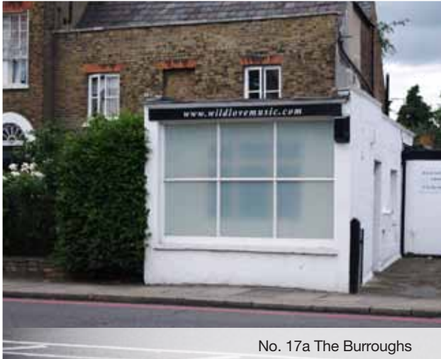
No. 17a The Burroughs

No. 15, a two storey, three windows wide yellow brick built property marks the end of this attractive group. It has a double pitch slate roof, behind a parapet. At first floor level the centre window is blocked, the others having red brick gauged window arches. The front door is positioned centrally, to a pair of hipped, canted bay windows with casement windows; the porch is missing from the original scheme.