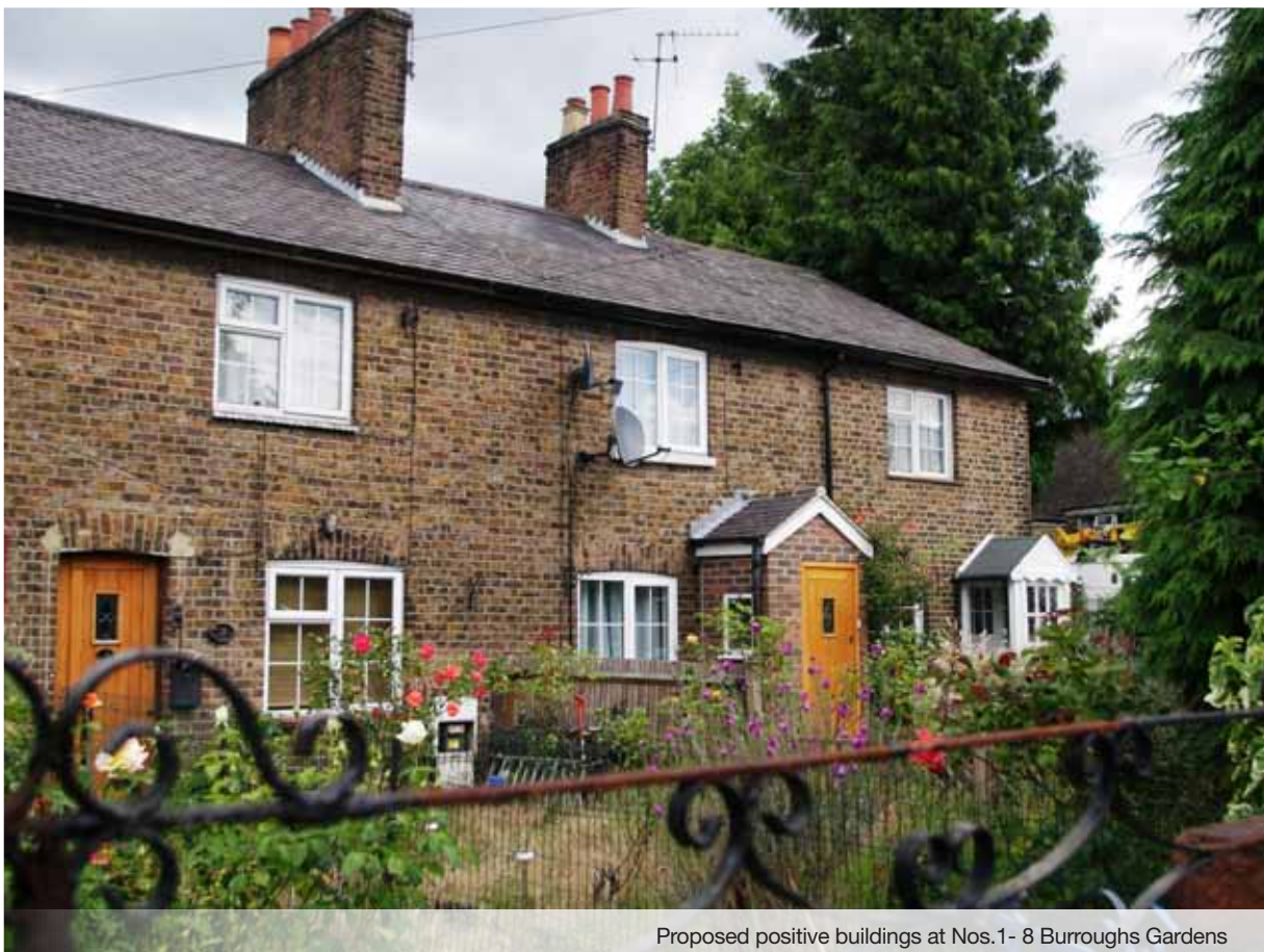
Proposed positive buildings at Nos.1- 8 Burroughs Gardens

As well as statutorily listed and locally listed buildings, there are many other buildings within the Conservation Area which make a positive contribution to its character and appearance. All catagories of building, whether listed, locally listed or 'positive' are indicated on the Townscape Appraisal map. There are 13 buildings within the Conservation Area which are proposed for the status of 'positive buildings'. These buildings have been indentified during the survey process and as with listed and locally listed buildings there is a general presumption in favour of their retention. Any application for the demolition of these buildings will therefore need to be accompanied by a reasoned justification as to why the building cannot be retained, with emphasis on its state of repair and possibilities for re-use.