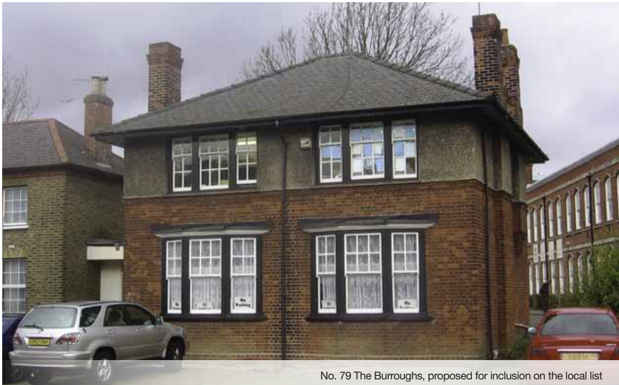
No. 79 The Burroughs, proposed for inclusion on the local list

Nos. 63 – 77 The Burroughs is a strong group of Victorian terraced locally listed houses. The group is set back from the street behind attractive front gardens with low level boundary walls. The terrace is built of yellow brick with a slated roof and dominant chimney stacks. Each property is two storeys and three windows wide at first floor. The majority of these properties still display their original features including single glazed sash timber windows and front doors. Some of the porches have, however, been enclosed, and other properties have compromised the overall appearance of the group by inserting Upvc windows.