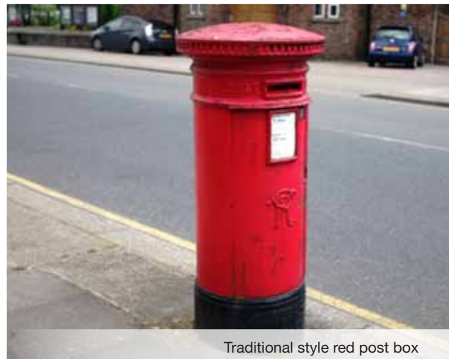
Traditional style red post box