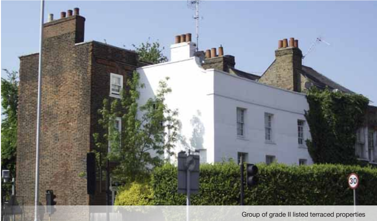
Group of grade II listed terraced properties

No. 13, also known as Ivey House due to the presence of a large Ivy climbing its front elevation, is two storeys in height, with a full height bow window, faced in yellow brick with slated mansard roof and two round headed dormer windows, which sit behind a low parapet. A tall chimney stack rises to the left side of the roof.