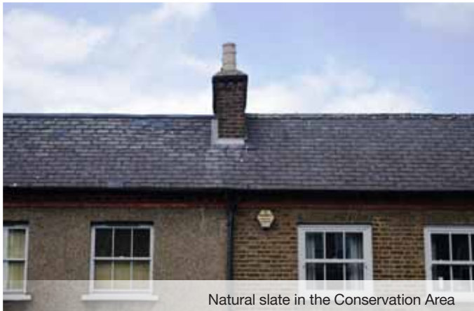
Natural slate in the Conservation Area

The Victorian enthusiasm for the Vernacular Revival in the later 19th Century brought back the use of machine made tiles, and these can be found on a small row of shops at Nos. 57 – 61 The Burroughs.