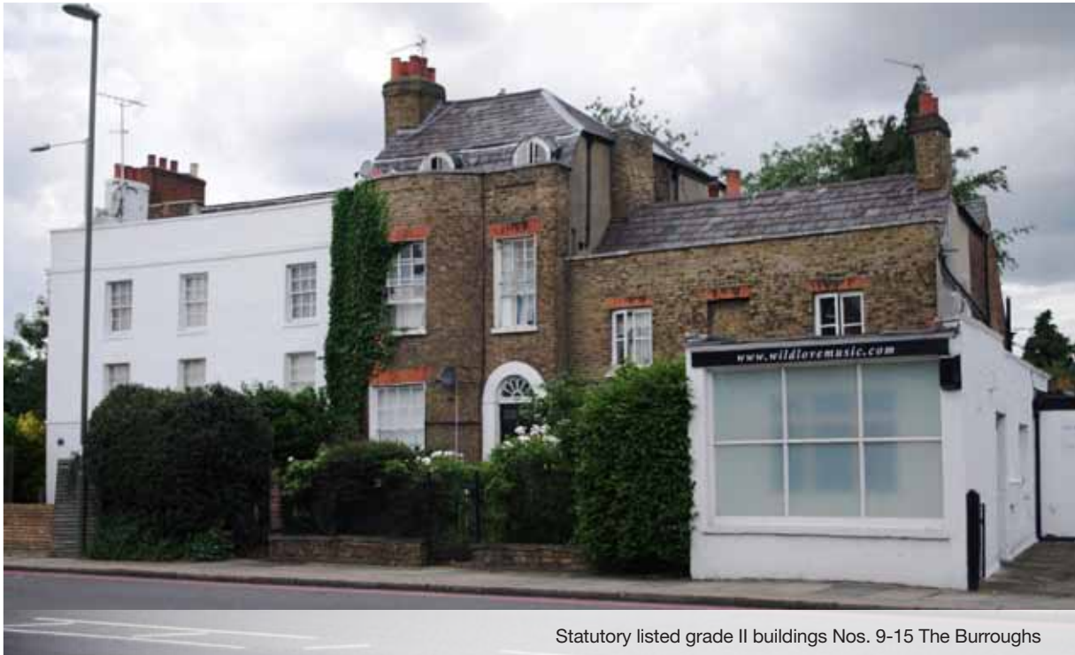
Statutory listed grade II buildings Nos. 9-15 The Burroughs

There are 12 listed buildings within the Conservation Area, all of which are grade II listed. These are buildings, objects or structures considered to be of special architectural or historic interest, which need to be preserved for future generations. Statutory listed buildings are protected by legislation in the Planning (Listed Buildings and Conservation Areas) Act 1990. Details of all listed buildings are included in Appendix 1.