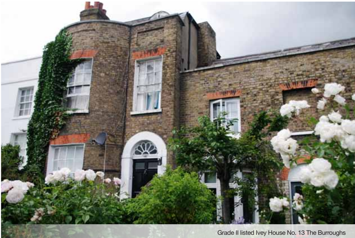
Grade II listed Ivey House No. 13 The Burroughs

No. 13, also known as Ivey House due to the presence of a large Ivy climbing its front elevation, is two storeys in height, with a full height bow window, faced in yellow brick with slated mansard roof and two round headed dormer windows, which sit behind a low parapet. A tall chimney stack rises to the left side of the roof.