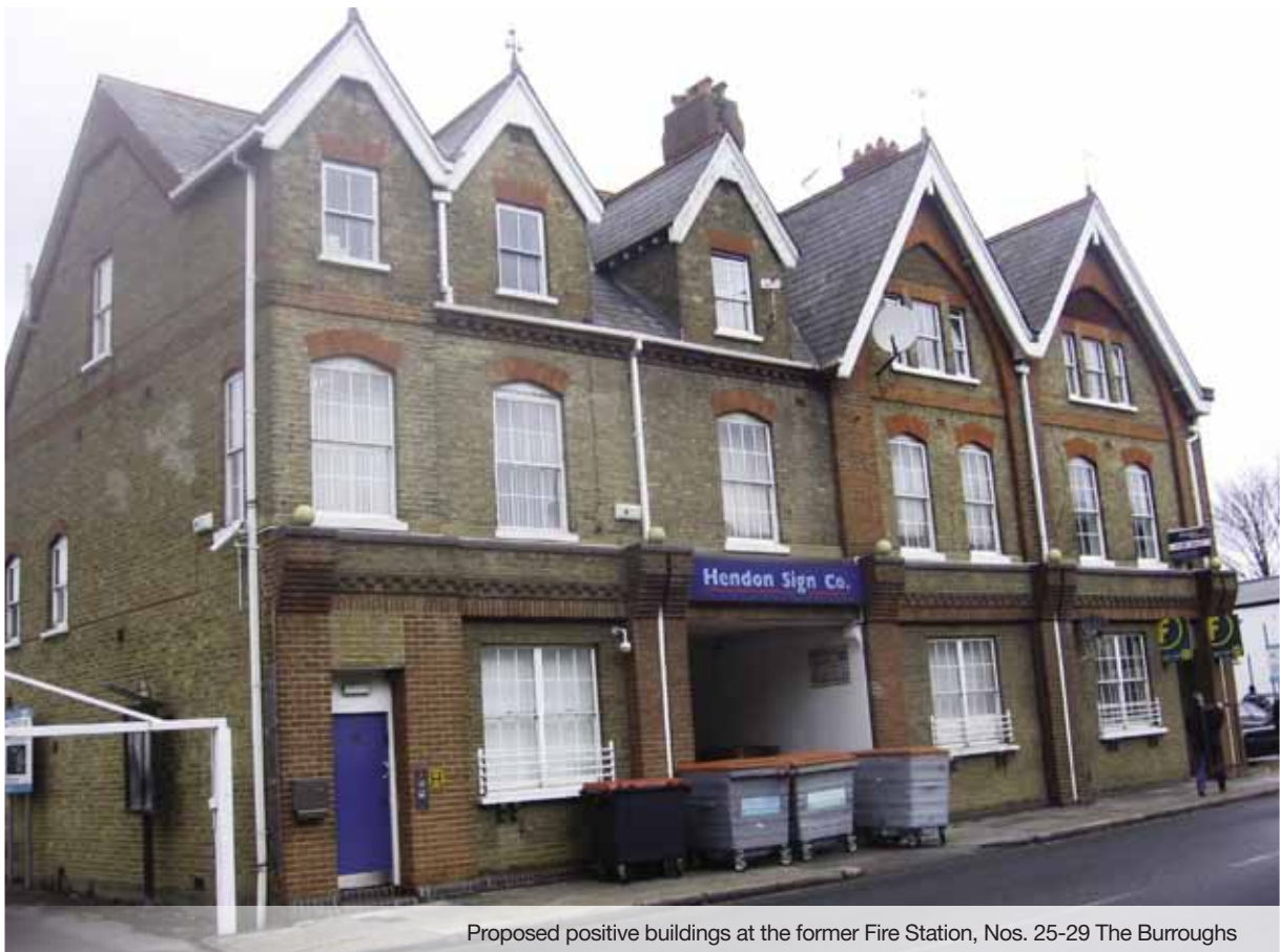
Proposed positive buildings at the former Fire Station, Nos. 25-29 The Burroughs