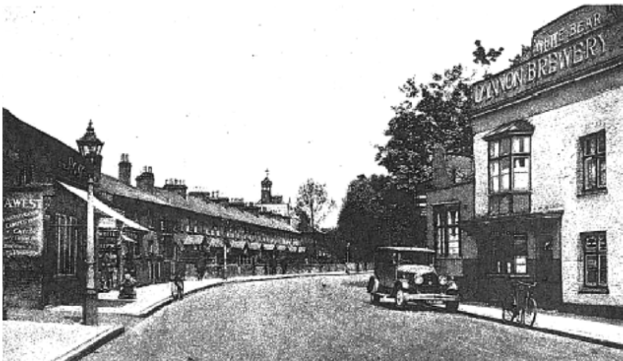
140. This postcard of The Burroughs catches the White Bear shortly before it was rebuilt in 1931-2. The inn has a long history: it is probably one of the buildings shown on a 1597 map, and manor courts were frequently held there up to 1916.

It is believed that there has been an inn at the site of The White Bear Public House since Tudor times, with the name the "White Bear" in use since at least 1736. It is here that the Lord of the Manor held his court until at least 1916. Between 1690 and 1890 a fair was held during Pentecost near the site of the present pub, and the local hay farmers from around the area would come to hire mowers and hay makers for the summer harvest. The fair was also renowned for dancing and county sports, attracting many visitors. The existing pub was rebuilt in 1932.