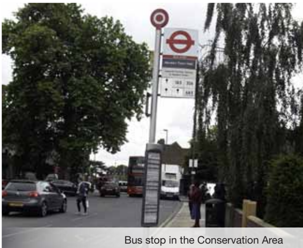
Bus stop in the Conservation Area

Area is varied in its design, mixing both modern standard products, such as railings, with the more traditional, such as a red letterbox, some of which is more suited to the area than others. A variety of different street signage is found across the Conservation Area, particularly at the junction with Watford Way. Whilst such signage may be necessary, it detracts from the special character of the Conservation Area.