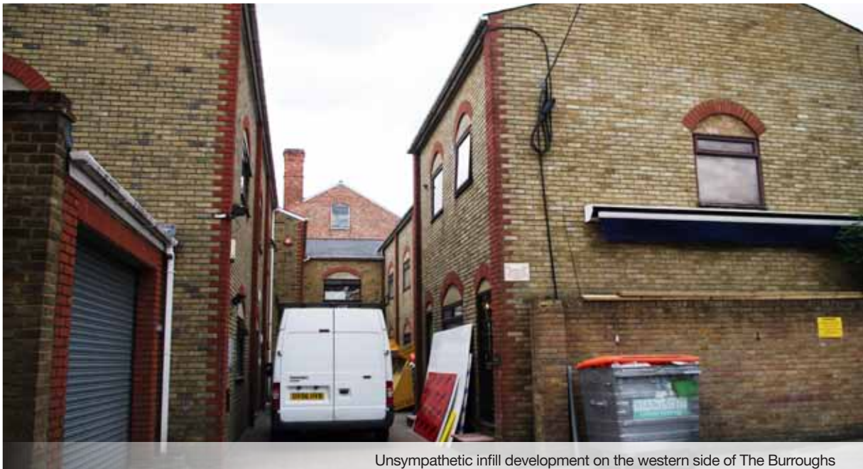
Unsympathetic infill development on the western side of The Burroughs