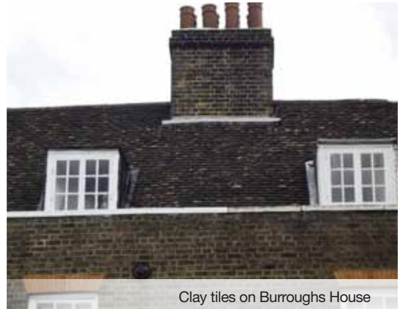
Clay tiles on Burroughs House