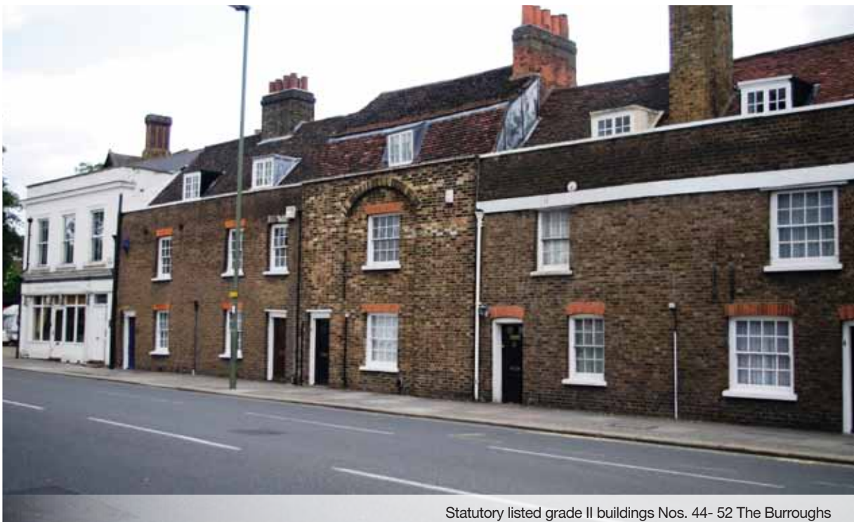
Statutory listed grade II buildings Nos. 44-52 The Burroughs

There are 12 listed buildings within the Conservation Area, all of which are grade II listed. These are buildings, objects or structures considered to be of special architectural or historic interest, which need to be preserved for future generations. Statutory listed buildings are protected by legislation in the Planning (Listed Buildings and Conservation Areas) Act 1990. Details of all listed buildings are included in Appendix 1.