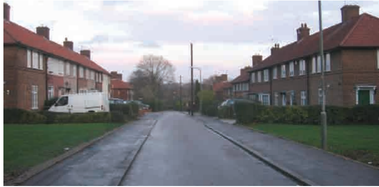
Orange Hill Road into Norwich Walk