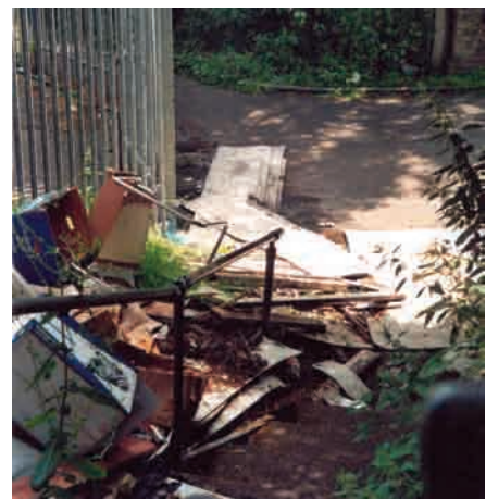
Poor quality environment around the Silk Stream