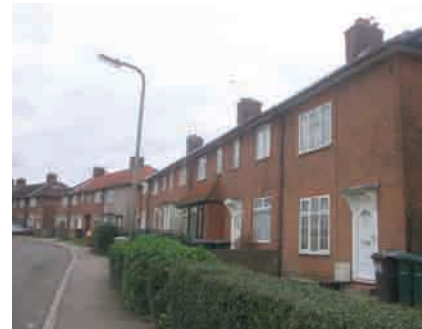
A row of houses along The Meads