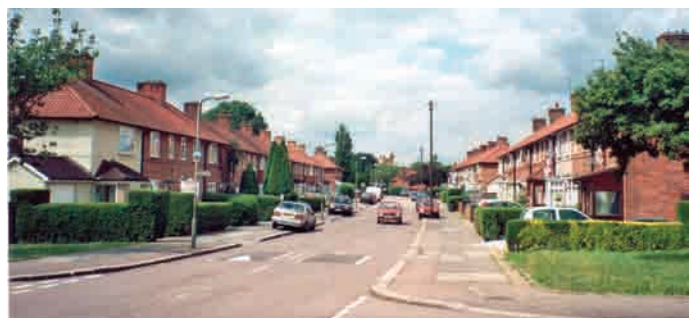
Views into Horsecroft Road