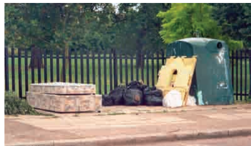
Fly tipping at entrance to Watling Park