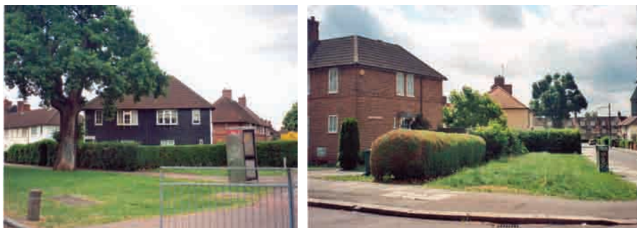
Corner plots situated at Goldbeaters Grove and Wosley Grove