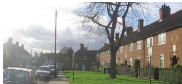
Terraces along Storksmead Road