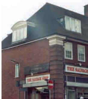
Two styles of original dormer window