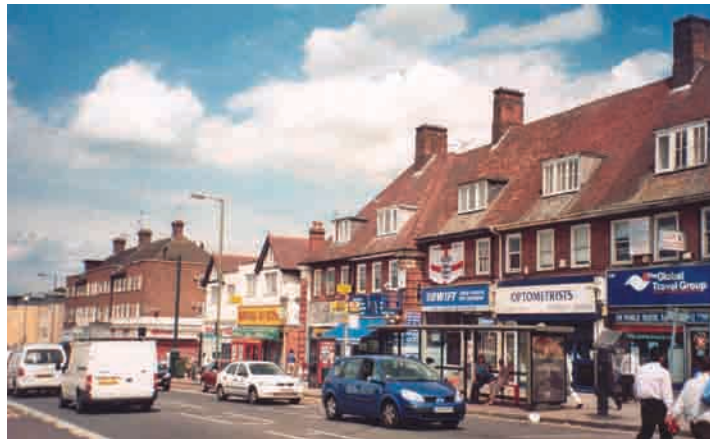
Shops along Burnt Oak Broadway

3.1 Burnt Oak Burnt Oak Broadway runs directly to the west of the Watling Estate. It is along the route of the pre-Roman part of Watling Street, which crossed the Thames around Lambeth and by Roman times ran on to St Albans. Such long distance roads did not necessarily generate settlements except where there was some local reason for growth such as a market. This was not the case at Burnt Oak. Little development was attracted to the area until the last century. The Hyde, to the south of Watling Estate, was recorded in 1281 and for about 600 years appears to have been the only settlement along the Edgware Road between Cricklewood and Edgware.