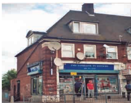
Example of a prominent corner building with a cluttered appearance