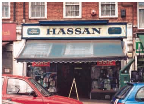
A good quality shop front displaying a canvas blind

Alterations to shops and other buildings include the addition of satellite dishes and replacement windows and doors. Almost all of the original shopfronts have been replaced, although one good Art Deco shop front exists at Hassans (no. 33 Watling Avenue). Many shops still use the original canvass blinds. Trading and associated grill and cage structures spill onto the wide pavement in front of the shops. Whilst this adds a certain vibrancy to the area it tends to result in a cluttered messy street scene and blocks views of the buildings. The area is vibrant, vital and very busy during the day. At night it is quiet and somewhat desolate.