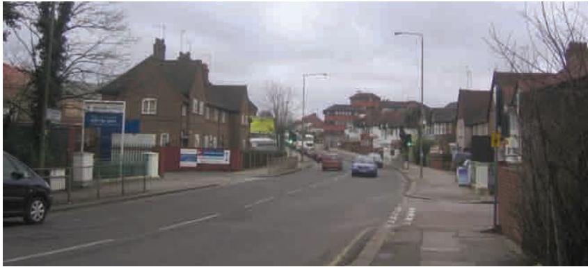
Views of Deansbrook Road into Burnt Oak Broadway