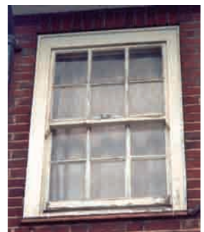
White painted timber sashes