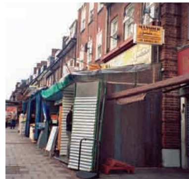
Cages fronting shops along Watling Avenue