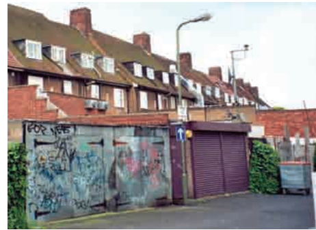
The backs of shops suffer badly from graffiti