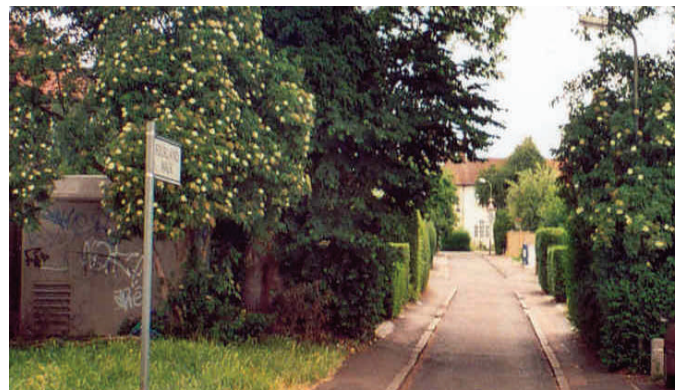
Views into Fourland Walk

There are areas in Watling Estate which illustrate the clever use of undulating relief to create interest and beauty. For example, westerly views to Watling Avenue where the shops can be seen climbing the hill from Watling estate. Here buildings can be seen stepping up and down gentle slopes, and taller buildings such as blocks of flats positioned on slightly higher ground to emphasise their importance.