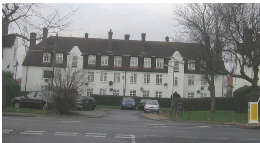
View from Mostyn Road towards Watling Avenue

Long range views terminated by the deliberate positioning of a building or other feature e.g. Mostyn Road north into Watling Avenue and south to Blundell Road