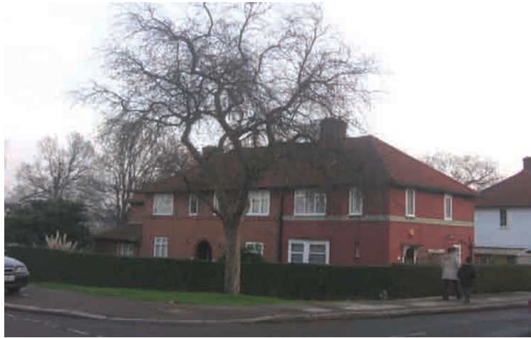
Corner treatment of Colchester Road from Abbots Road