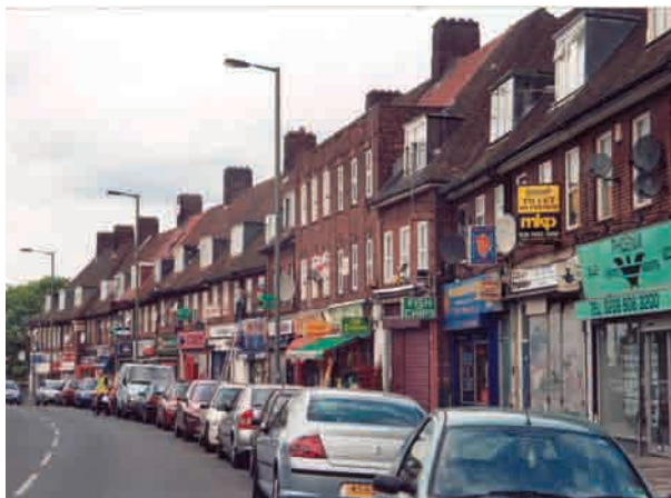
Deansbrook Road shops

Deansbrook Road is a much smaller local secondary centre. It serves local people for convenience goods in the main and therefore pedestrian and traffic turnover and movement are frequent. There are a high number of night time uses such as fast food takeaway shops, an off-licence and some convenience stores.