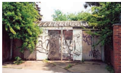
Graffiti on garages (located adjacent to the conservation area)