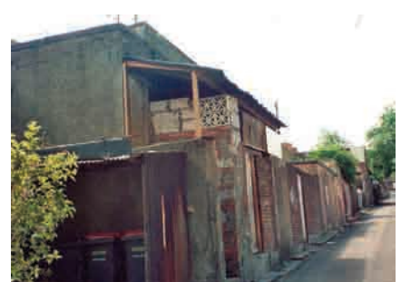
The service roads are unattractive