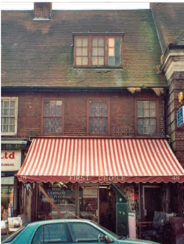
Traditional timber windows and awnings in Wating Avenue