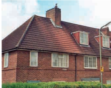
Steeply pitched and hipped roof