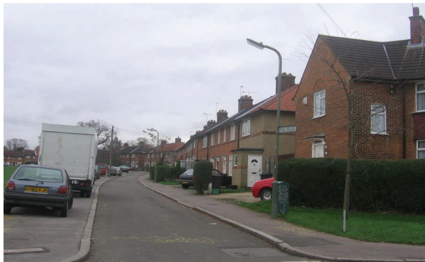
Long range view into The Meads

Long range views terminated at various points by gentle curves in roads for example The Meads, Dryfield Road