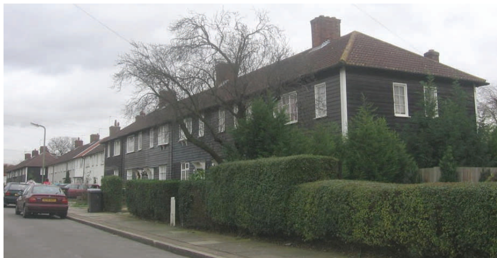
Numbers 1 to 31 Storksmead Road

Whilst many houses have been altered removing, replacing or altering traditional features, some houses with much of the original detailing can be found. Amongst the best examples are the terrace at the junction of Abbots Road/Deansbrook Road, (particularly doors); nos. 1 to 31 (odd) Storksmead Road; the terrace at the extreme west of Deansbrook Road; cul-de-sac of flats at Watling Avenue opposite its junction with Mostyn Road and Maple Gardens (porches).