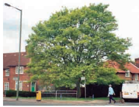
Tree displayed as a focal point at junction of Deansbrook Road and Dryfield Road