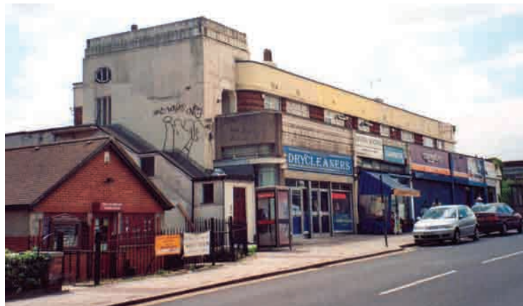
Art Deco inspired buildings along Silk Stream Parade