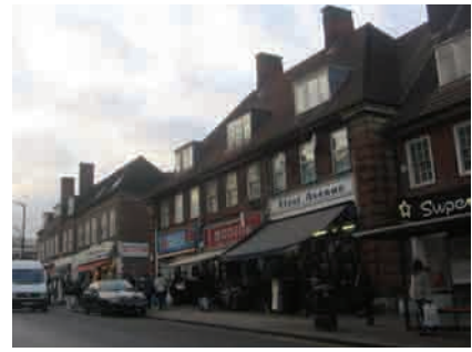
Views along Watling Avenue towards Burnt Oak Broadway

Alterations to shops and other buildings include the addition of satellite dishes and replacement windows and doors. Almost all of the original shopfronts have been replaced, although one good Art Deco shop front exists at Hassans (no. 33 Watling Avenue). Many shops still use the original canvass blinds. Trading and associated grill and cage structures spill onto the wide pavement in front of the shops. Whilst this adds a certain vibrancy to the area it tends to result in a cluttered messy street scene and blocks views of the buildings. The area is vibrant, vital and very busy during the day. At night it is quiet and somewhat desolate.