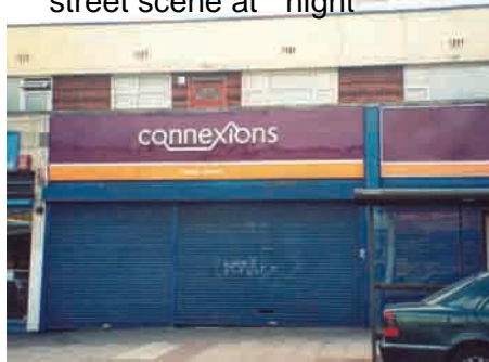
Oppressive and unattractive solid metal security shutters