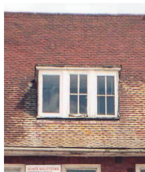
Some windows have been re-glazed without bars