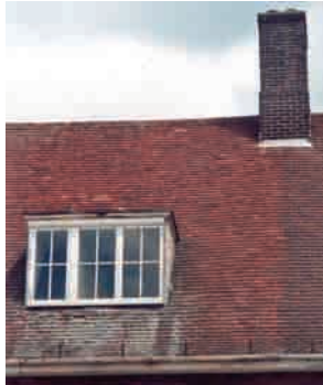
Traditional dormer window set in clay tile roof