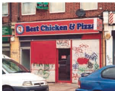
Ugly metal shutters with graffiti