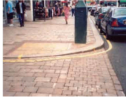
A crossover laid in tegula setts