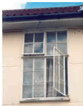
White painted crittal windows