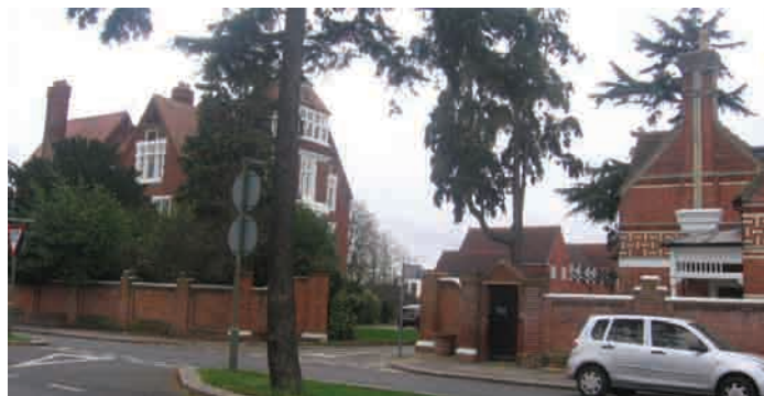
Gatehouse of St Rose's Convent

Late-19 th century. The gatehouse is two storeyed and faced in red brick with red tiled roof and stone mullioned windows. It is enriched with polychromatic patterned brick banding at first floor.