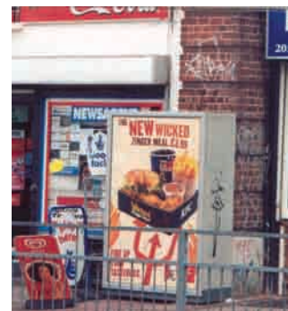
Inappropriately sited advertisements