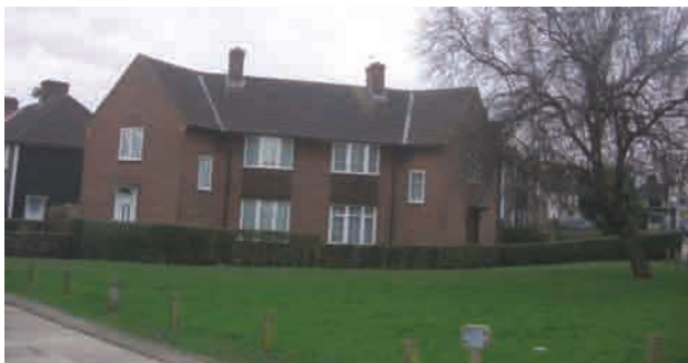
An example of a strategically located block