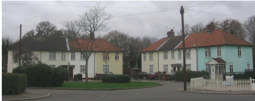
Central green fronting properties in Banstock Road