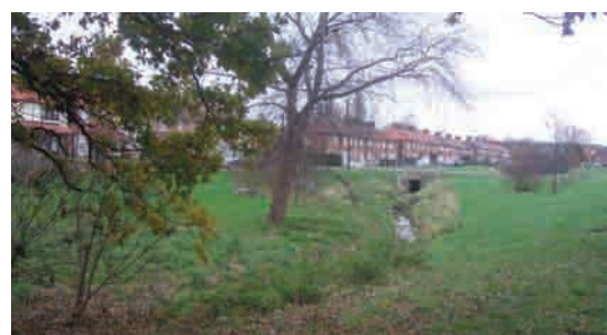
Views into the Meads

The Meads is an open, unadorned green space allowing open views between flanking roads. It has a natural feel with little apparent formal landscaping. The southern end is used as allotments and is enclosed by a chain link fence.