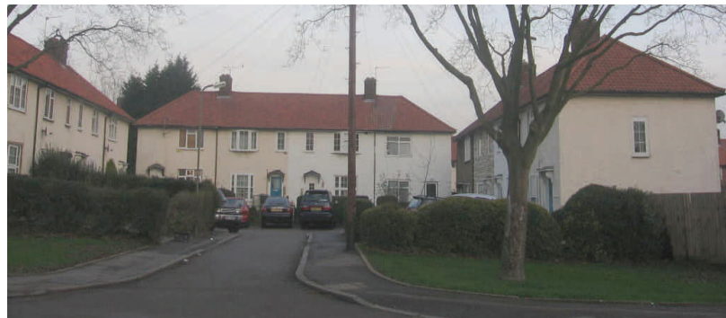
Islip Gardens from Edwin Road

Attractive roofscapes with dormer windows and prominent chimneys stacks