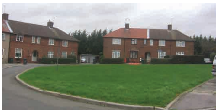
Central green fronting properties along Banstock Road