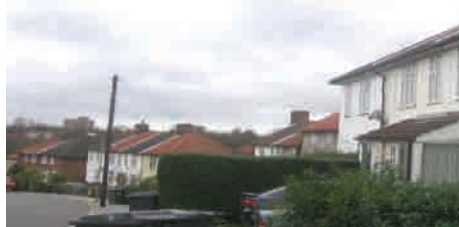
A row of houses along Banstock Road