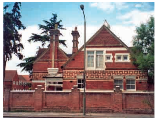
Buckland Court (formerly known as St Rose's Convent)