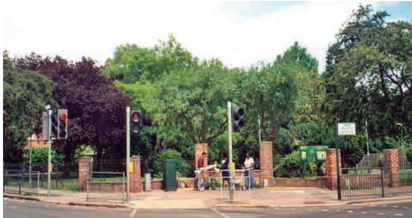
Entrance to Watling Park

This is the largest of the three areas, and has been sympathetically landscaped with paths, pedestrian bridges and a variety of mature specimen trees and shrubs. There are attractive brick piers and metal railings around the entrance to the park at Watling Avenue.