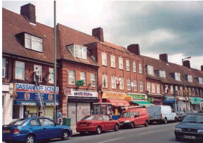
Deansbrook shopping parade