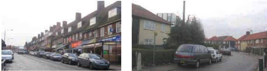
Cars parked along Watling Avenue and Barnfield Road