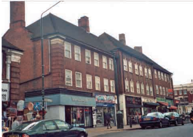
Watling Avenue shops

Watling Avenue is a large local centre forming a part of the Burnt Oak Broadway shopping area. During the day it is very busy, bustling, vibrant and noisy in places with shoppers and traffic movements. The environment is sometimes unpleasant directly behind the shops as the Silk Stream clogs up with silt and refuse. The shops are mainly family businesses serving all sectors of the community but there is a predominance of shops serving the diverse population. Many are trading in front of the shops on wide forecourts and temporary structures under canopies have been erected to facilitate this.