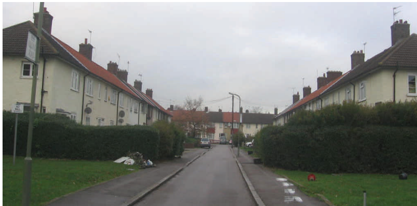
Views into Milling Road from Wosley Grove