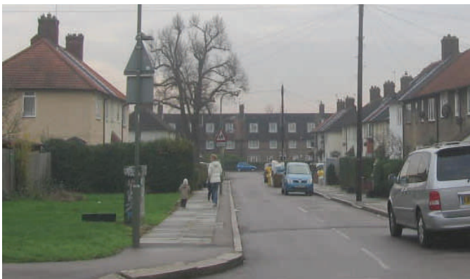
Views into Wosley Grove from Abbots Road