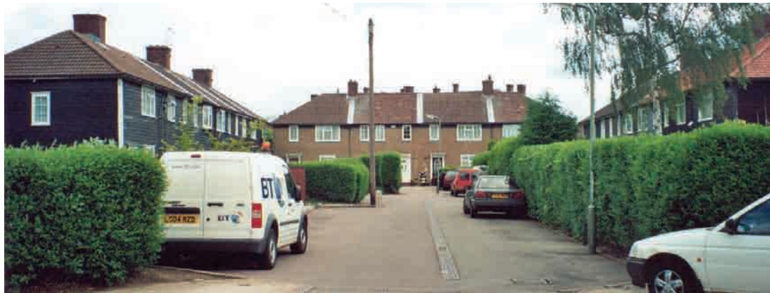
A groups of houses in a courtyard off Mostyn Road