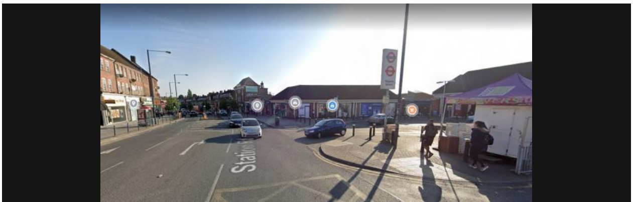
Edgware town centre