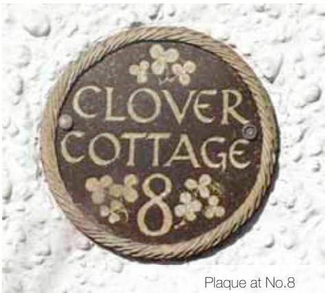
Plaque at No.8

Before the houses around the green had been completed the residents gave them individual names. They were often chosen because of local characteristics, including Brookside , Hedgeside and Greenside , being close to the brook, a hedge and the village green. Clover Cottage , as there was clover in the back garden and Darley Dale after the owner's birthplace. Other names were chosen simply due to their pleasant sound including Westwynde , Coolrain , Merriecroft and Inglenook . In the early days of Village Road almost every house had its own name.