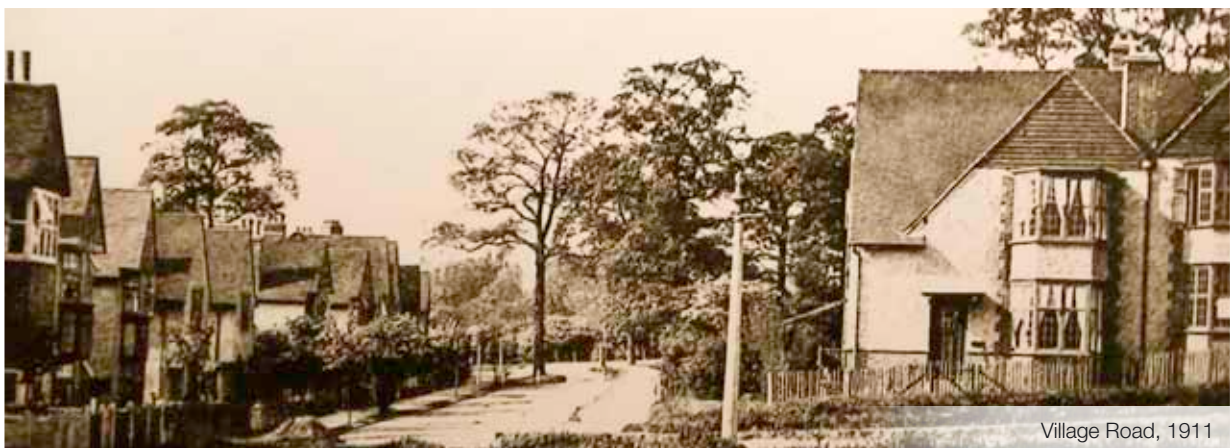
Village Road, 1911

The leasehold restrictions included the control over both external and internal alterations which, would “... destroy or interfere with the uniformity of the premises with the adjoining houses...” or which might “...in any way obstruct or lessen the access of light or air to or interfere with the view from the adjoining houses” (From a 1930 conveyance).