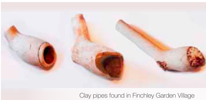
Clay pipes found in Finchley Garden Village

The conservation area is not identified as being of archaeological interest, although clay pipes (believed to belong to farm workers) have been found in the garden of a local house in Village Road. Two Local Areas of Special Archaeological Significance do however exist to the east and west of the conservation area (Finchley and Hendon).