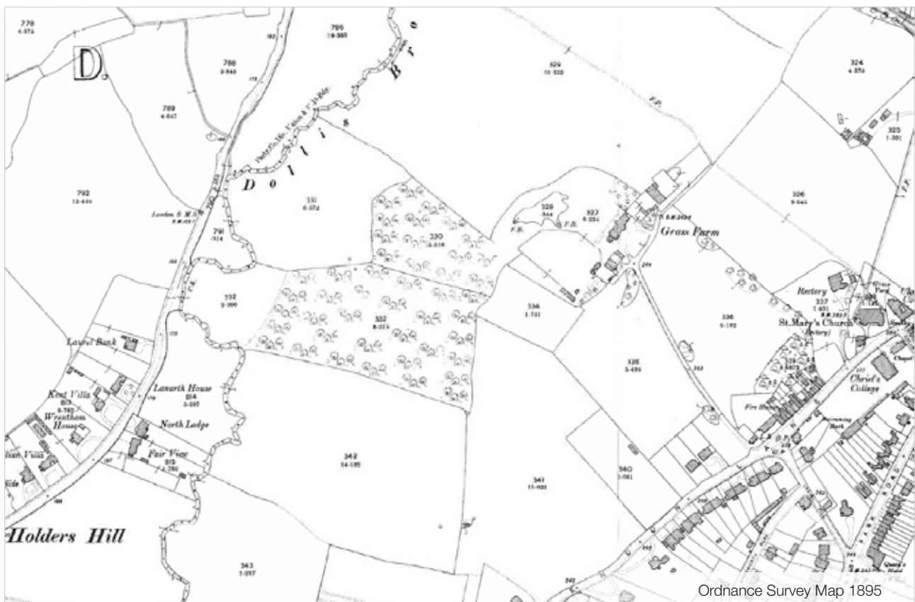
Ordnance Survey Map 1895

It was not until 1909 that the land on which Village Road now sits was first developed, as detailed in Section 3.