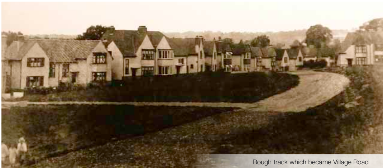
Rough track which became Village Road

The design of the front boundary fencing was carefully considered and the hedges and trees on and around the village green were well maintained. Village Road was originally a private road and its status was ensured by means of a gate at its junction with Hendon Avenue, while a rope or chain was used to restrict access from Cyprus Avenue. In 1941 the central green was taken over by the local council and used for allotments during the war. Then in 1955 a metalled public road replaced the rough private track and was adopted by Finchley Borough Council.